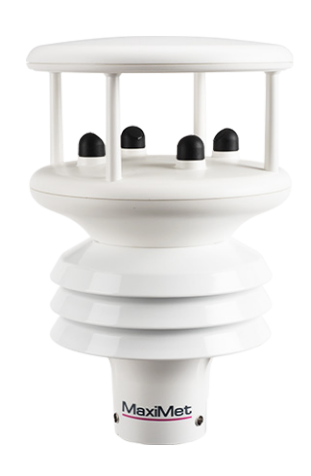
MaxiMet GMX500 measures 5 parameters.